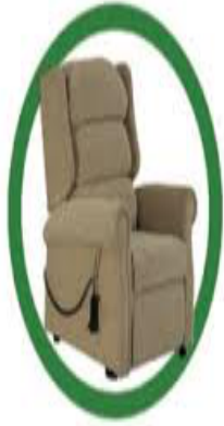
Rise & Recline Chairs