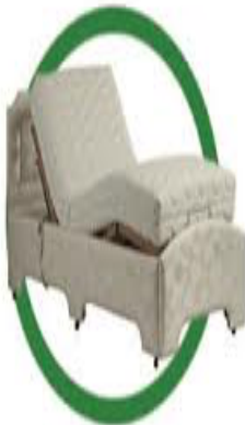
Custom Made Adjustable Beds