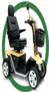
Scooters & Wheelchairs