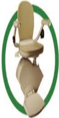
Stair Lifts & Bath Lifts